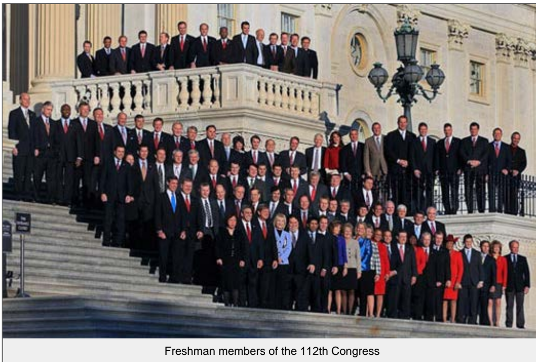
Freshman members of the 112th Congress

AIP and many other organizations advocate increasing federal support for R&D, of course. But two recent sources of such advocacy have been especially encouraging.