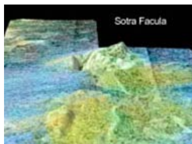
Sotra Facula is the best example found

In " Giant Ice Volcano Candidate Found on Saturn Moon ," which also appeared in New Scientist , Eric Betz writes about the strongest evidence for volcanoes spewing out ice from beneath the surface of Titan.