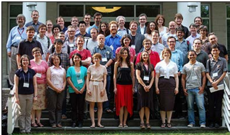
Early-career science historians from across the globe contributed their expertise to make the conference a learning experience for all.